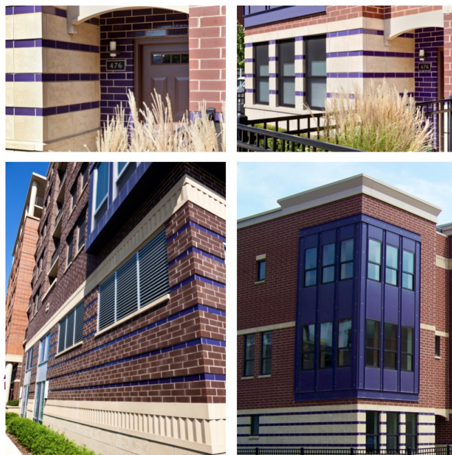
Parkside of Old Town Chicago Illinois

Elgin-Butler Glazed Bricks are extruded clay, ceramic glazed masonry units for wall applications, structural walls, partition walls, multi-wythe walls or veneers. The ceramic finish is available in many standard and custom colors, and the units offer a durable, permanent, non-fading wall system that has an impervious ceramic glazed face with a high abuse tolerance against impact, abrasion and graffiti.