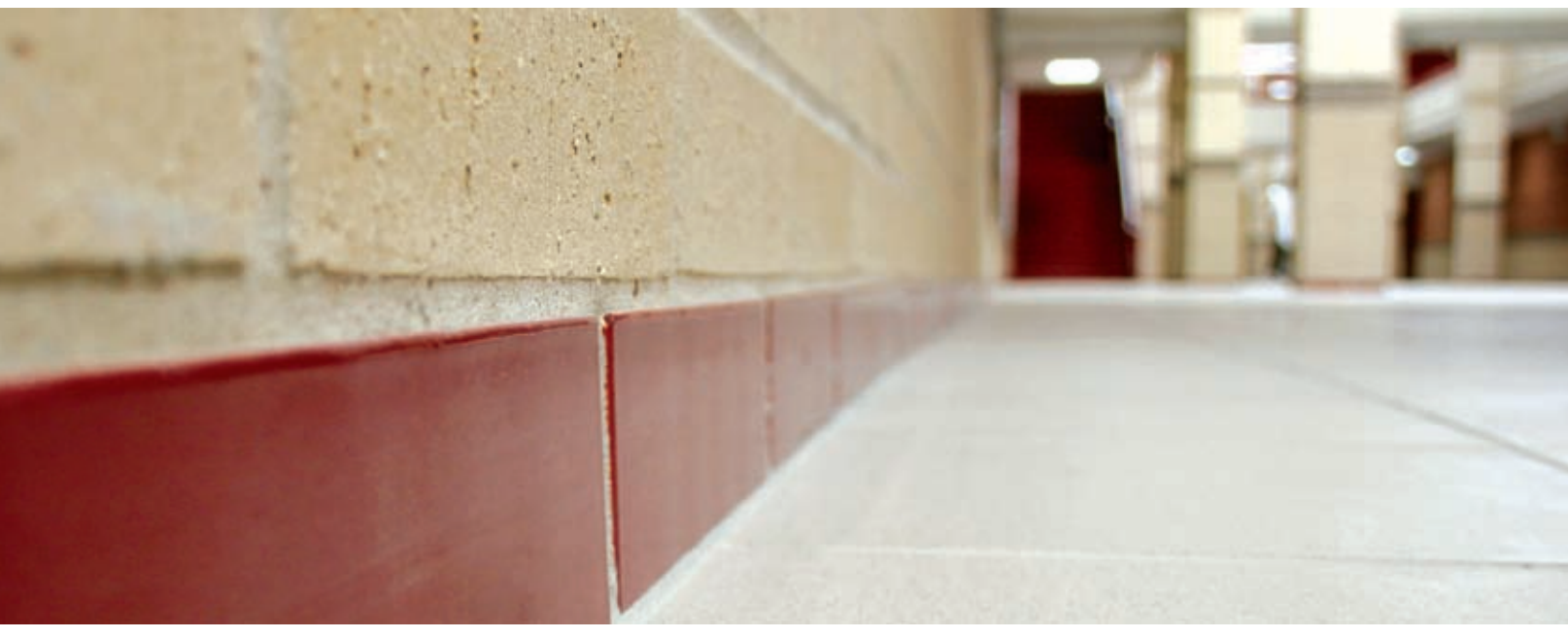
4"x16" Quik-Base Units; Cypress Woods High School - Cypress, TX