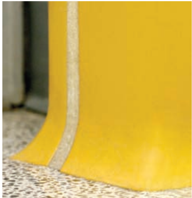
Jones Technical High School – Chicago, IL Cove Base Corner

• Shapes: Furnished as shown on the plans in accordance with the current standard production of the manufacturer. All external corners shall be bullnose unless otherwise noted. Internal corners shall be square unless otherwise noted.