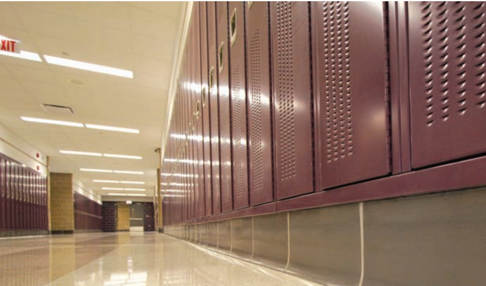
Little Village High School – Chicago, IL